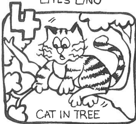
CAT IN TREE